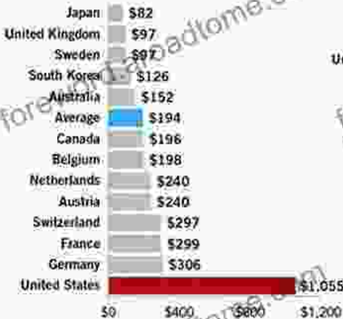
LONG-TERM CARE PER CAPITA (DOLLARS)